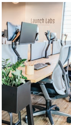
Launch Labs Co-Working Space at CEC's Signal House.